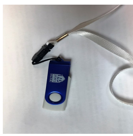
The digital age equivalent of the Council leader notebooks and new member packets are now included in one USB drive for council presidents and treasurers.

The Councils welcome their new members with informative materials highlighting the work of the AFT, IFT and WSTU.