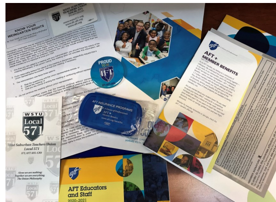
The packets for new members include small gifts, membership and free insurance applications, voter registration QR code along with pertinent and helpful information to help new members become acquainted with their Union.

On August 3 Council Presidents and Treasurers met virtually with 571 staff, field service directors and the Local president and treasurer to