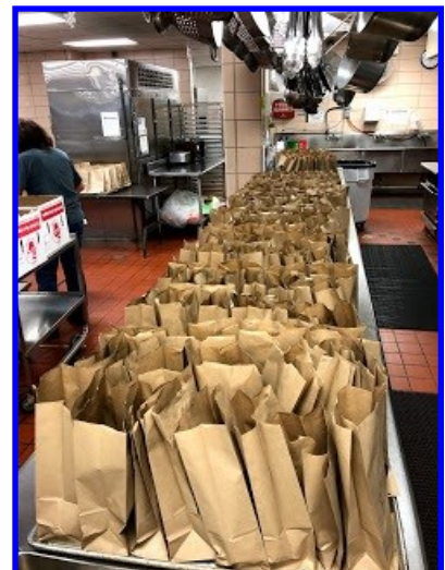
Members of DuPage District 88 Councils prepare to distribute hundreds of meals from Addison Trail H.S. to students in the community.