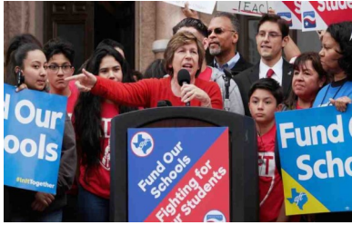
Weingarten at a rally for public education in Austin, Texas, on March 11.

The wealthiest Americans don't have to worry about how they will pay for groceries, or a visit to a doctor when they're sick, or heat for their homes during frigid weather.