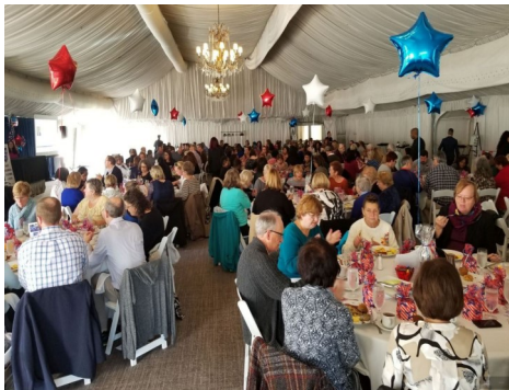
Over 170 attendees packed the Marquis for the 2018 Legislative Breakfast.