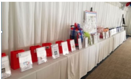
There were 50 winners of gift cards, gift baskets and an overnight at the Hilton Oak Brook Hills resort which were raffled.