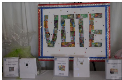
One of the most popular of the gift card raffle included lottery tickets spelling out the theme of the breakfast, VOTE.