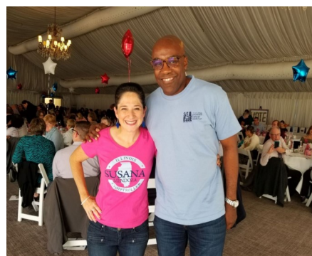
Comptroller Susana Mendoza enthusiastically returned to the 571 breakfast as she was a candidate at the 2016 breakfast. Susana was supporting Attorney General candidate Kwame Raoul.