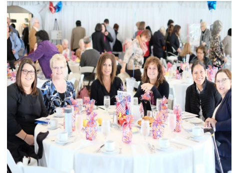
571 members from the District 88 PSRP Council and newest Computer and Technical Assistance Council enjoyed the excitement of the event.