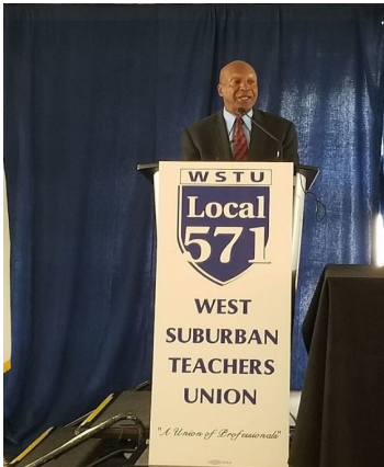
Jesse White, Secretary of State, has served Illinois for many years and created several of the Secretary of State outstanding programs.