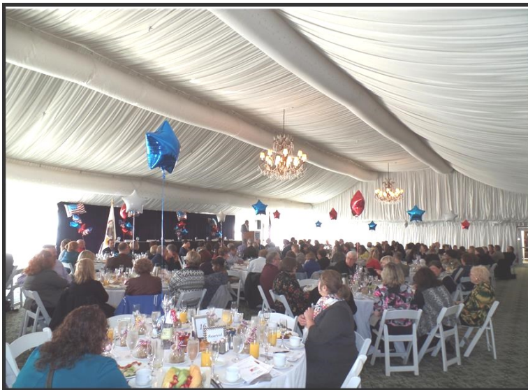
The new location for the 2015 breakfast provided a lovely and bright venue for sometimes “unsunny” comments of the speakers.