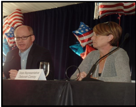
Senator Don Harmon responds to the question about pensions as Representative Deb Conroy waits to discuss the issue in agreement with the senator.