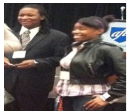
The 15-year-old female chair of education for “New Voice” thanks the AFT for supporting their efforts.

During the conference, the AFT members along with other community members united and walked the dark streets of Detroit in the annual volunteer program “Angels’ Night,” that was established to keep neighborhoods safe from pranks associated with Halloween.