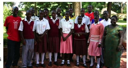
“Children UP” students and their mentors.

For more information about Children UP please visit: www.childrenup.org