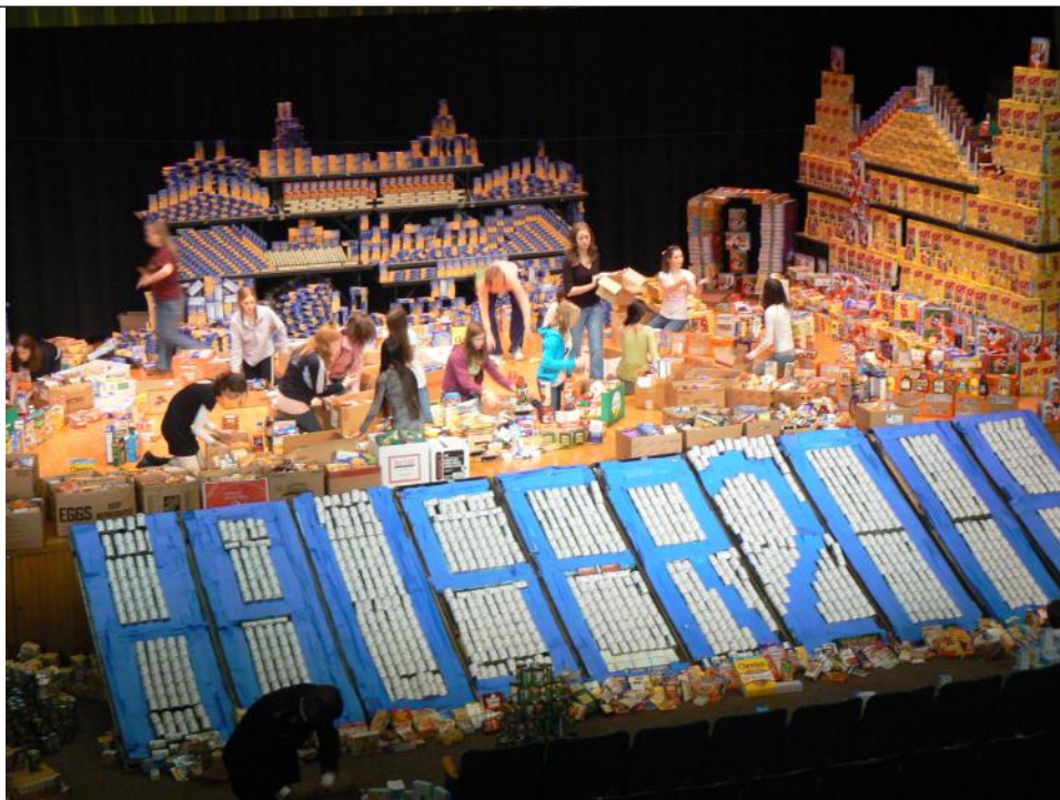
The Hauser Middle School auditorium stage contains only a few of 60,000+ food items collected by students and staff in the week before winter break. Non-perishable donations filled auditorium aisles stacked on choral riser shelf units and occupied half of the main entrance hallway. Teachers at Hauser are part of the Riverside Council of Local 571.

Overall, the recovery plan will provide vital aid to children, students, and