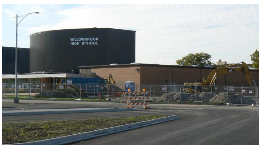
Financial support from Local 571’s COPE fund and the DuPage District 88 Teachers Council helped the district’s “Building The Future” campaign mount a successful referendum. Voters approved $110 million in bonds that are now paying for major renovations and new additions to Addison Trail and Willowbrook High Schools. October foundation work expanding Willowbrook’s music wing is pictured.

GIFTS TO COPE ARE NOT TAX DEDUCTABLE ON FEDERAL OR STATE INCOME TAXES