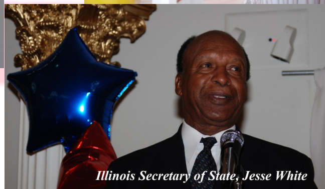
Illinois Secretary of State, Jesse White