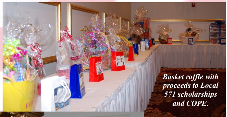
Basket raffle with proceeds to Local 571 scholarships and COPE.