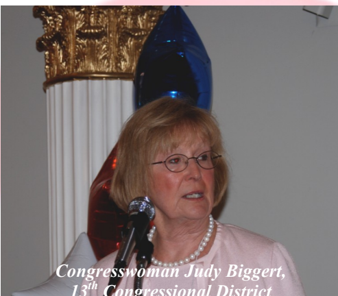
Congresswoman Judy Biggert, 13 th Congressional District

Contact your council president by Monday, September 19, 2011, for information and for a reservation. Only those mem- bers with a reservation will be admitted.